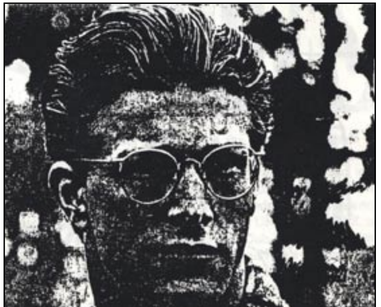
A yuppie brown-noser.

Upon my stay here, however, things have changed